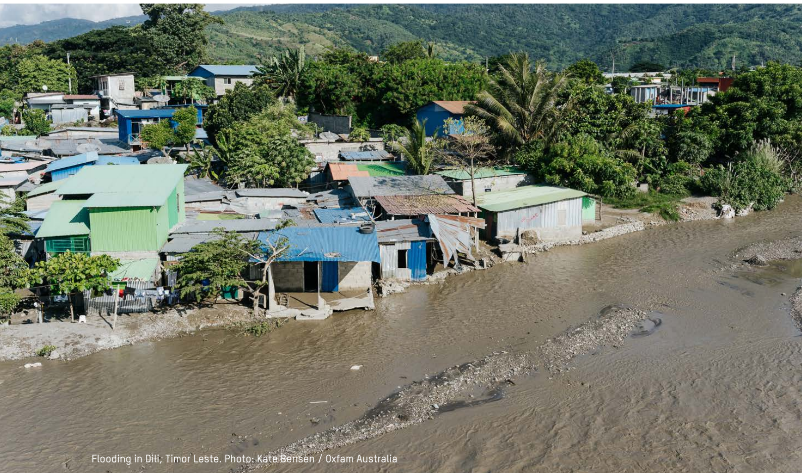
Flooding in Dili, Timor Leste.

Their lives and livelihoods depend on activities which are particularly vulnerable to more extreme and erratic weather. They often lack formal ownership of land and are more likely to live in marginal locations which have high exposure to climate hazards, making them extremely vulnerable. They have less protection, less resilience and therefore experience greater loss and damage, which accumulates over time.