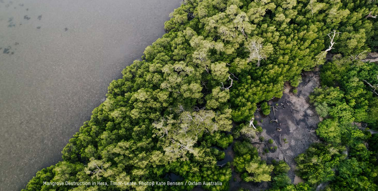
Mangrove Destruction in Hera, Timor-Leste.

has ripple effects on many other aspects of their lives such as livelihoods, education and exposure to gender-based violence. It induces urban-rural migration, contributes to conflicts and reinforces colonial legacies and other inequalities related to income, gender and power.