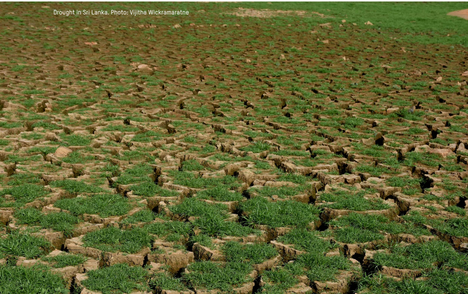
Drought in Sri Lanka.