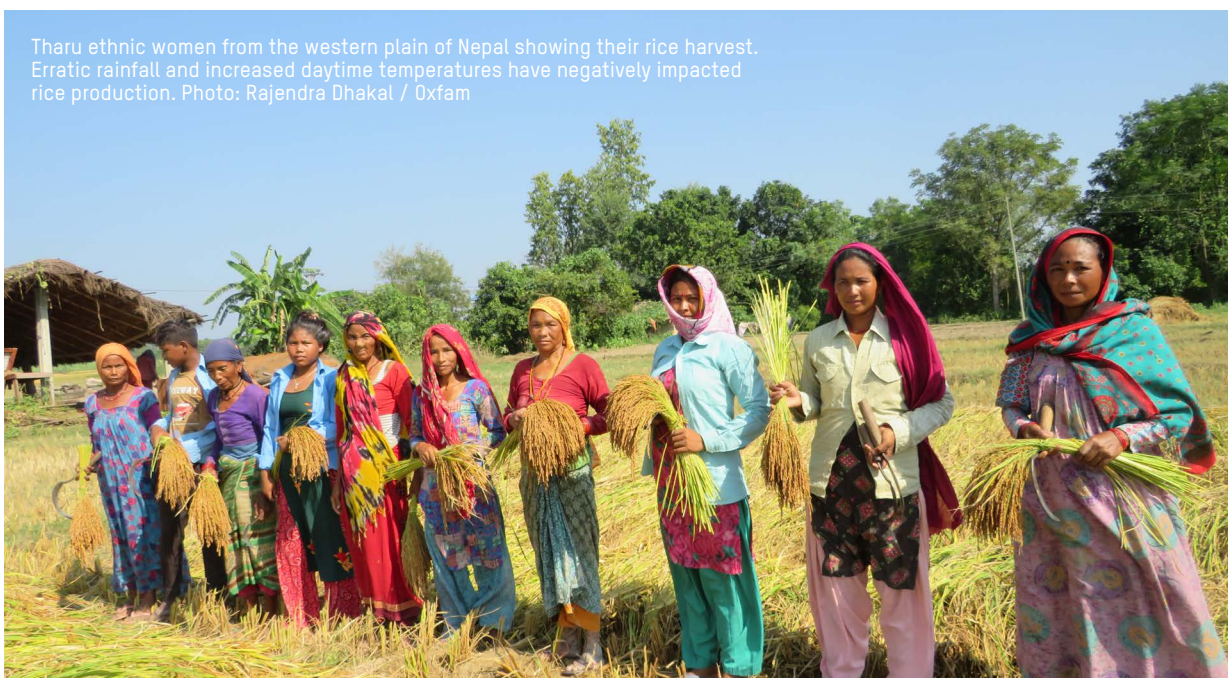
Tharu ethnic women from the western plain of Nepal showing their rice harvest. Erratic rainfall and increased daytime temperatures have negatively impacted rice production.

But those who did not have the security of tenure are afraid to invest because they fear losing these investments if they have to leave their lands or face evictions. Loss and damage to land not only affects the land rights of the affected communities but