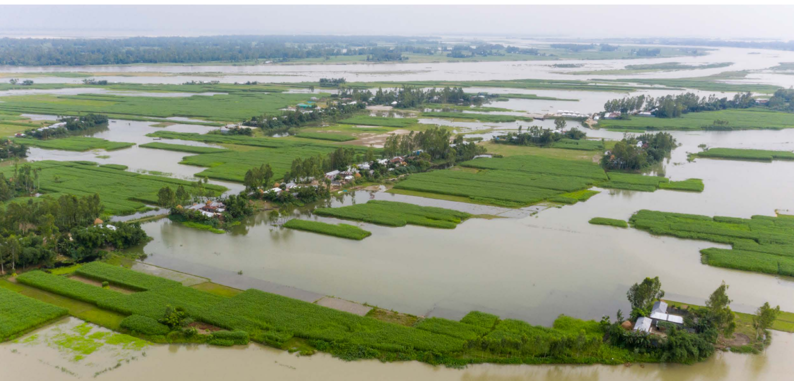
An example of severe flooding in Bangladesh.

Shamsun Nahar is a farmer from Hajrakhali, a village in Satkhira, Bangladesh. Her region is affected by salinity intrusion due to waterlogging and river