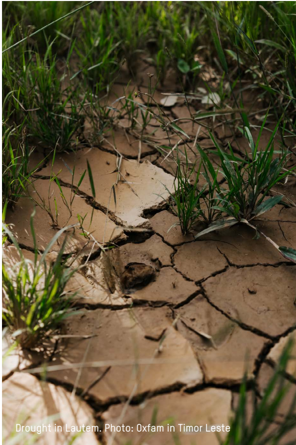
Drought in Lautem.

aggravates land inequality. These impacts have led to greater competition over land, which is a finite resource, and increased existing pressures on land use. Communities struggle to cope with loss and damage, unable to recover from them or improve their climate resilience.