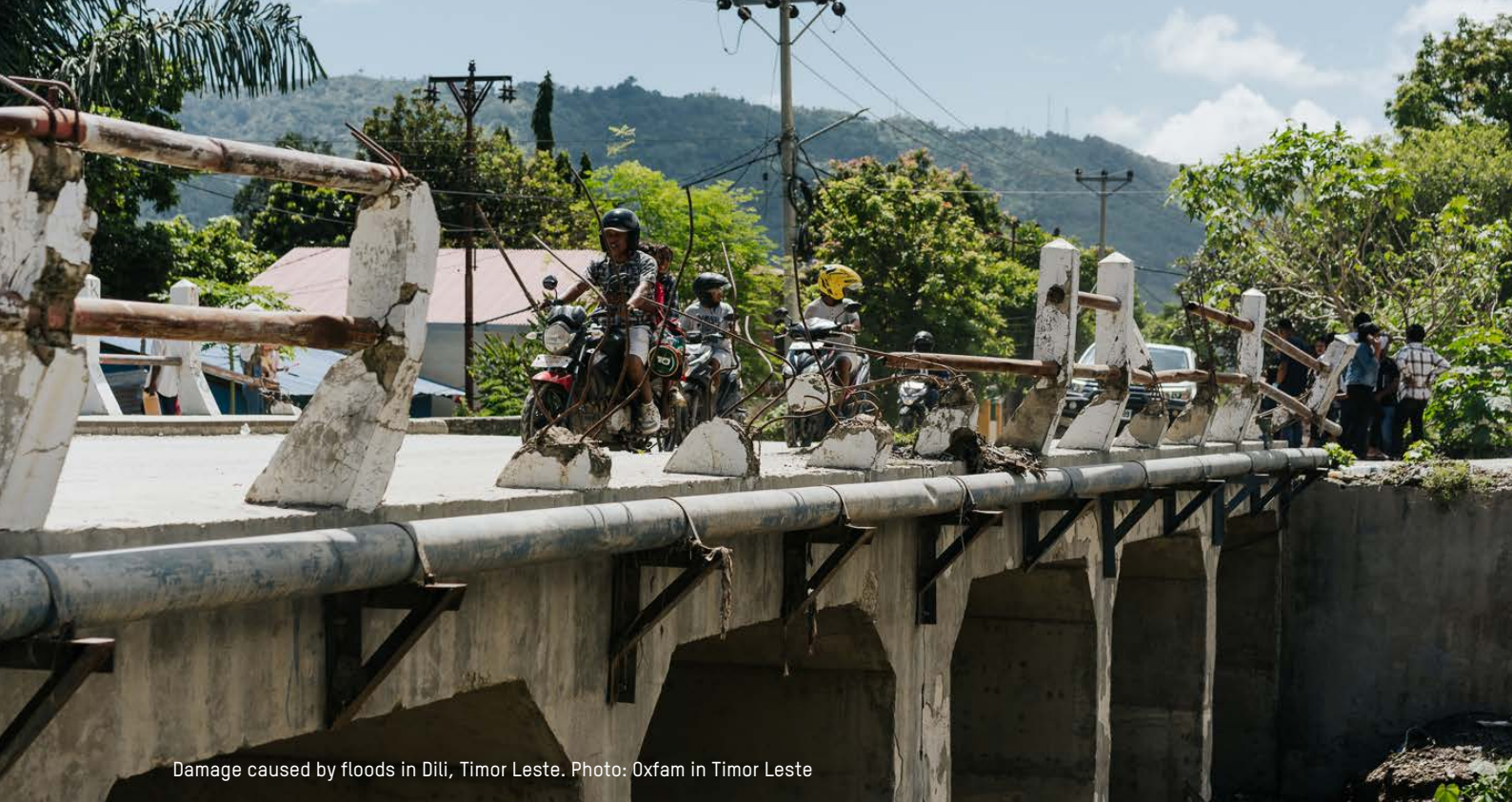
Damage caused by floods in Dili, Timor Leste.