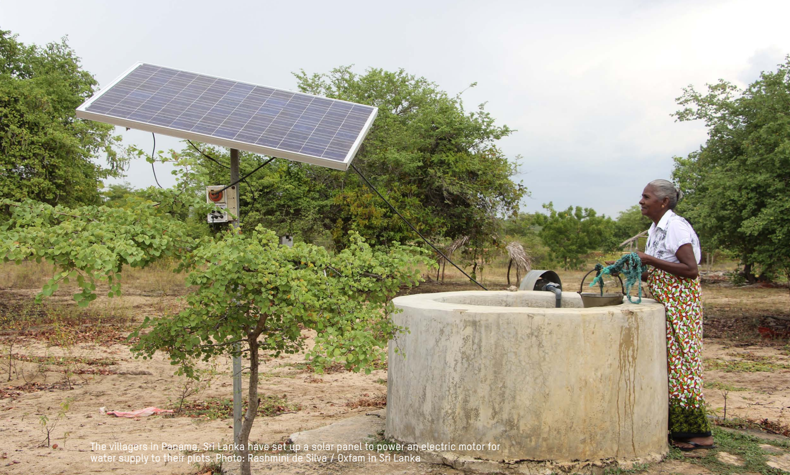
The villagers in Panama, Sri Lanka have set up a solar panel to power an electric motor for water supply to their plots.

‘We carry these losses to our next cultivating season. It affects our families, children’s education, household food security, health and all aspects of our lives. Recovery after a drought seems next to impossible to us at this state. The state is refusing to formalize our ownership and to watch our farming communities deteriorate in the face of extreme drought is now a question of our dignity and worth as small-scale food producers.’