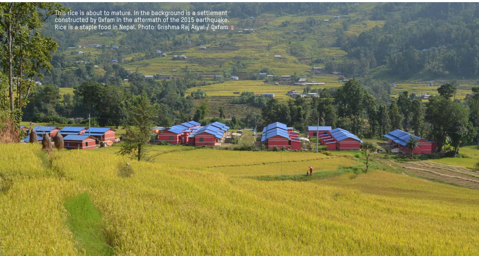
This rice is about to mature. In the background is a settlement constructed by Oxfam in the aftermath of the 2015 earthquake. Rice is a staple food in Nepal.

Land ownership is one of the factors that influences a person's recognition, status or position in society. Loss of land due to the climate crisis not only has